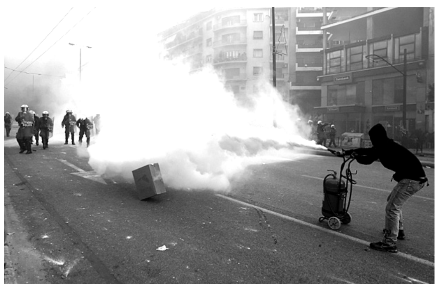
The ingenuity of people engaging in a collective struggle against capital is demonstrated as a rioter temporarily blinds police with a large, mobile fire extinguisher.