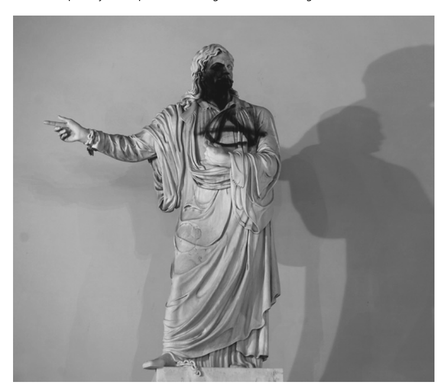
Anarchy in the cradle of democracy.