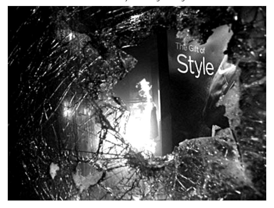
The gift of style indeed: Capital's boutiques, remodeled by the tides of revolt.