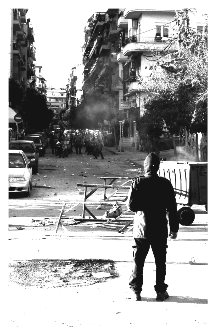
A scene from the battle torn streets of Athens.