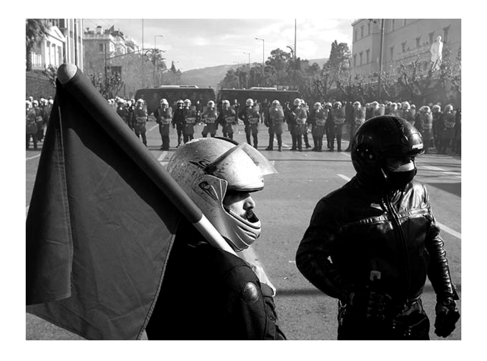
Mustachioed comrades ready to fight. A return to the path of fire, as the expression goes (!?)

- Fellow precarious workers from the occupied ASOEE