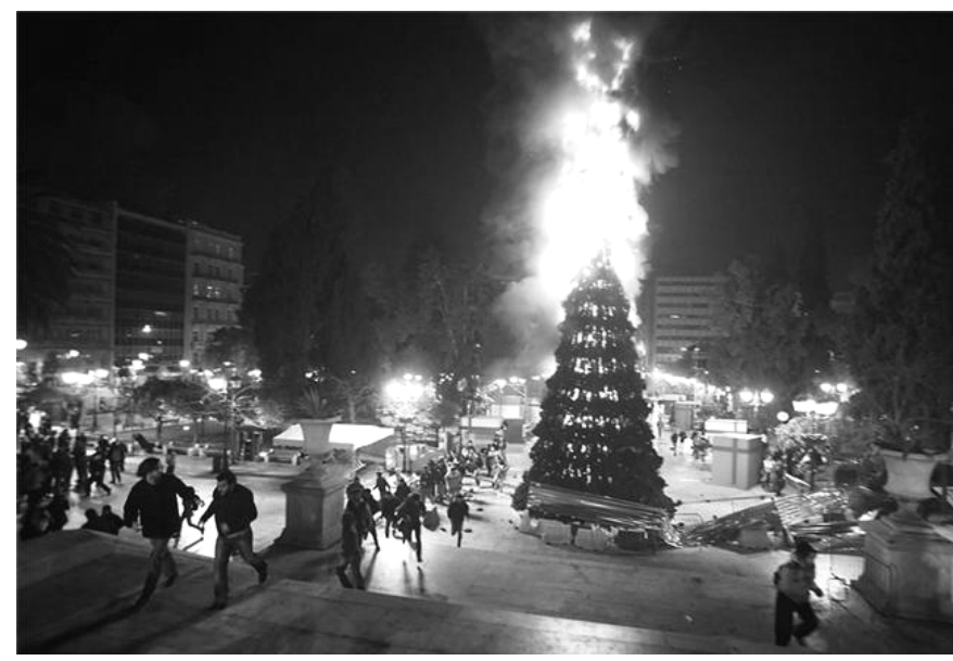
This year the holidays just won't be the same. Onlookers flee as the Christmas tree in central Athens is set alight.

- Initiative from the occupation of the Athens School of Economics and Business 11/12/2008