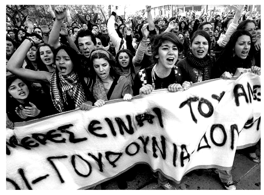
Angry young Greeks march against the police.