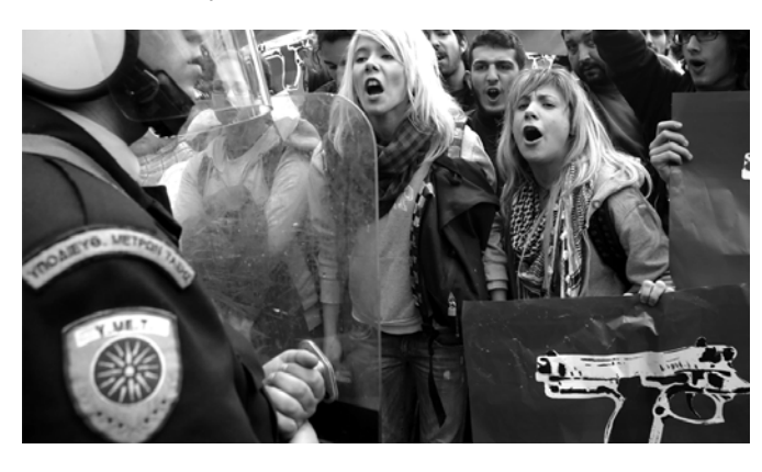
Students send a message to the true specialists and managers of violence: 'turn your quns around.'

- Occupied School of Theatre - Thessaloniki, December 9