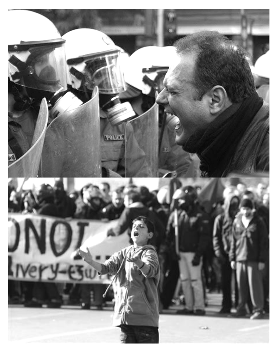
Cops, Killers, Pigs! Both young and old harangue the police – enforcers of the laws of capital, murderers in uniform.