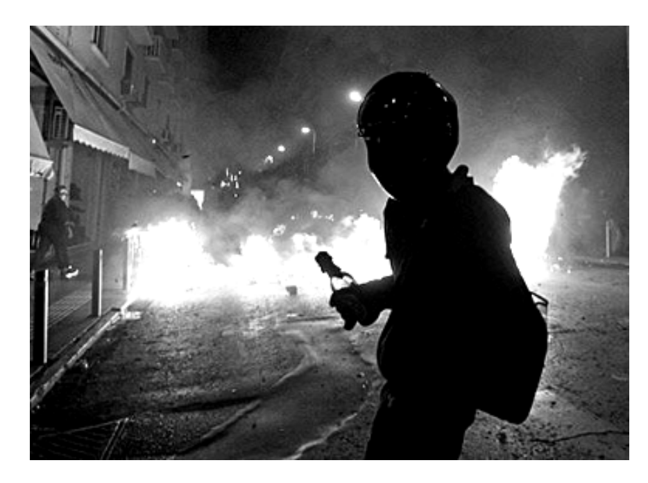
Greek Fire: Molotov cocktails were in heavy use during the height of the insurrection