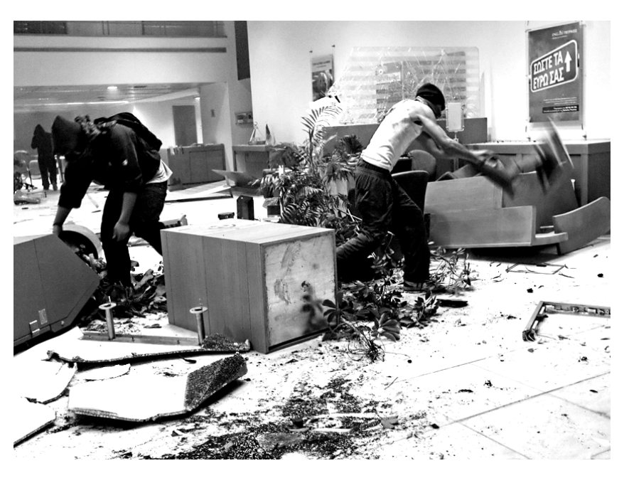
Rioters wreck the interior of a shop in Athens.